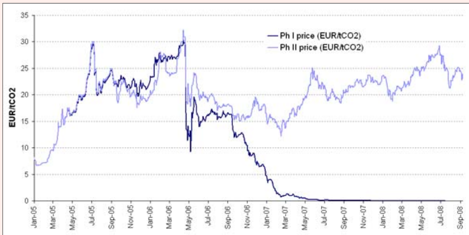
Phase I - Mar 2008 settlement price Phase II - Dec 2008 settlement price